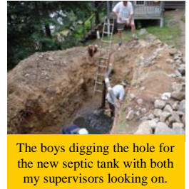
The boys digging the hole for the new septic tank with both my supervisors looking on.

As some of you may know I'm an official Biscoite. Gord and I spent a little over three weeks renovating the old camp at the landing. We put in a heated water line direct from Gord's drilled well, new plumbing, insulated the whole cabin, new floors, new walls, new shower, wood stove and a kitchen. It's very cozy and I should be a lot warmer this winter.