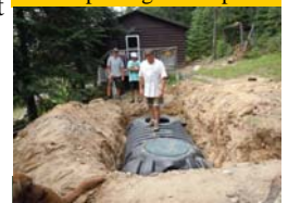
Ahh! It fits!