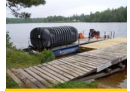
Transporting new septic